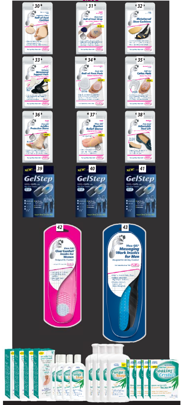
TRAY - Side 2