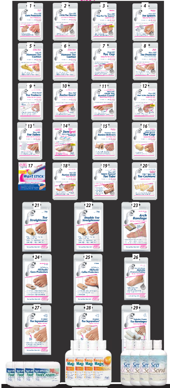
TRAY - Side 1